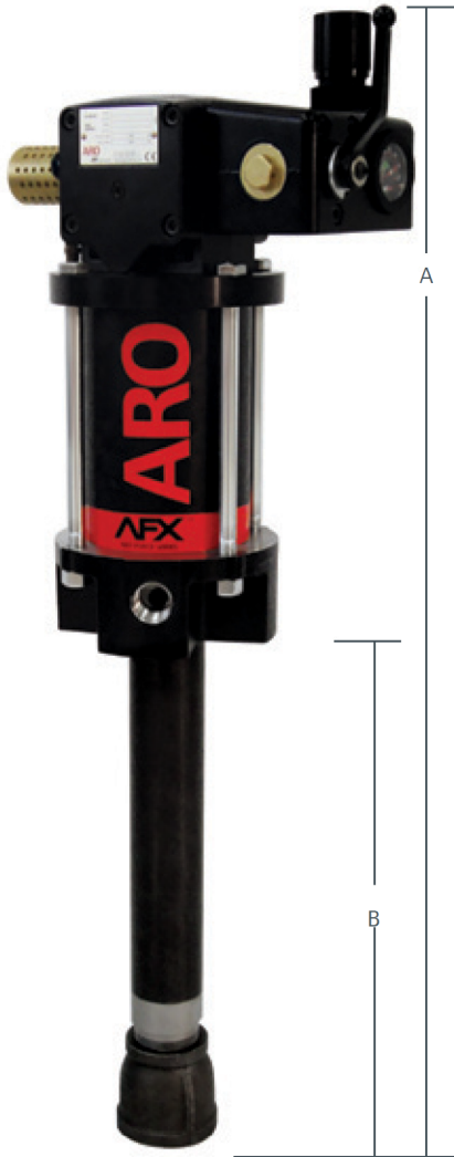
(Model shown w/ball valve regulator)

9:1 Ratio, 4-1/4" Air Motor, Lubrication Oil Service