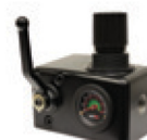
67442 Ball Valve Regulator