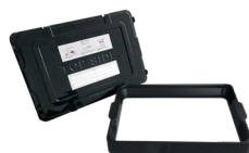
Vat Assembly with Vat Box