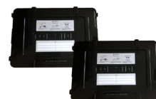
SOL Plus Vat Box (2 pcs)