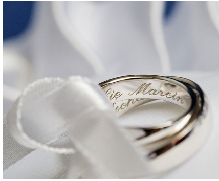
Personalising and engraving jewellery