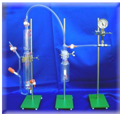
Liquid purge vessel