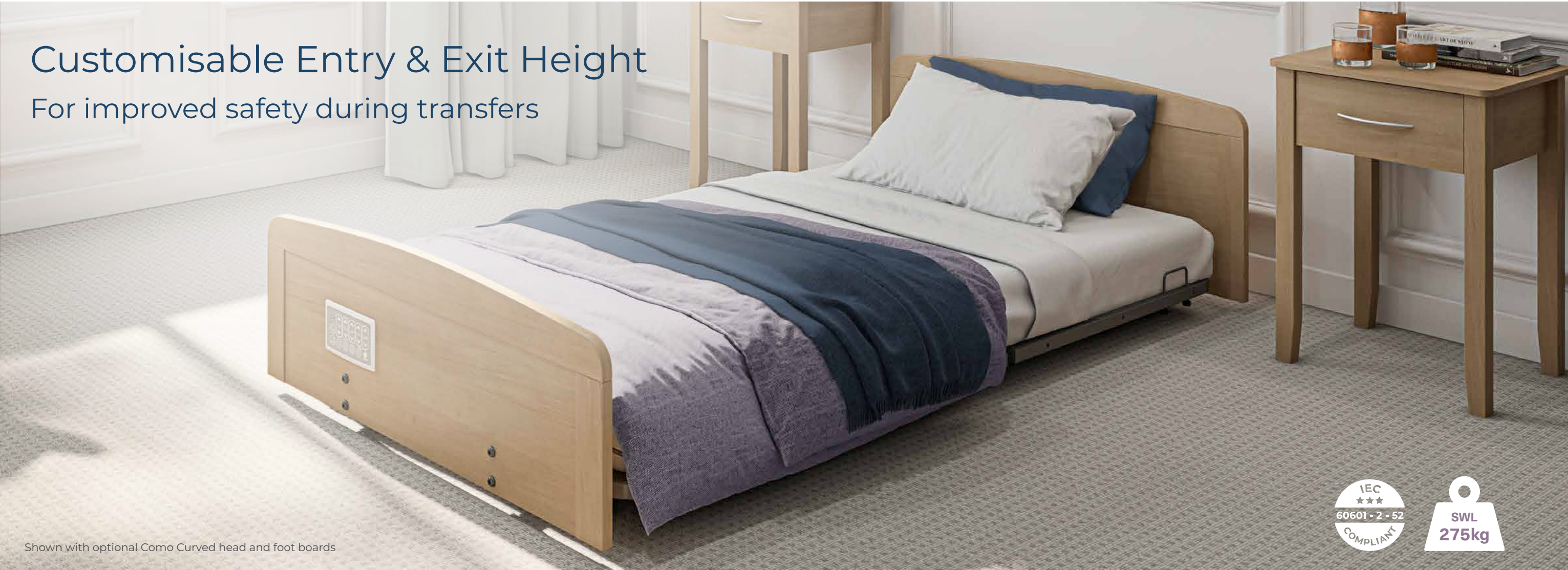
Shown with optional Como Curved head and foot boards

Customisable Entry & Exit Height For improved safety during transfers