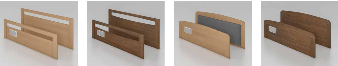
Tallo Generous outer frame and recessed inner panel with void for a luxurious aesthetic and a softer modern silhouette. Timber or laminate.