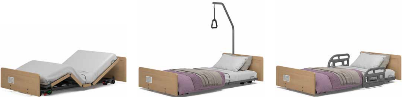
Low position, back and knee raised Sublime Teak side panels (accessory)