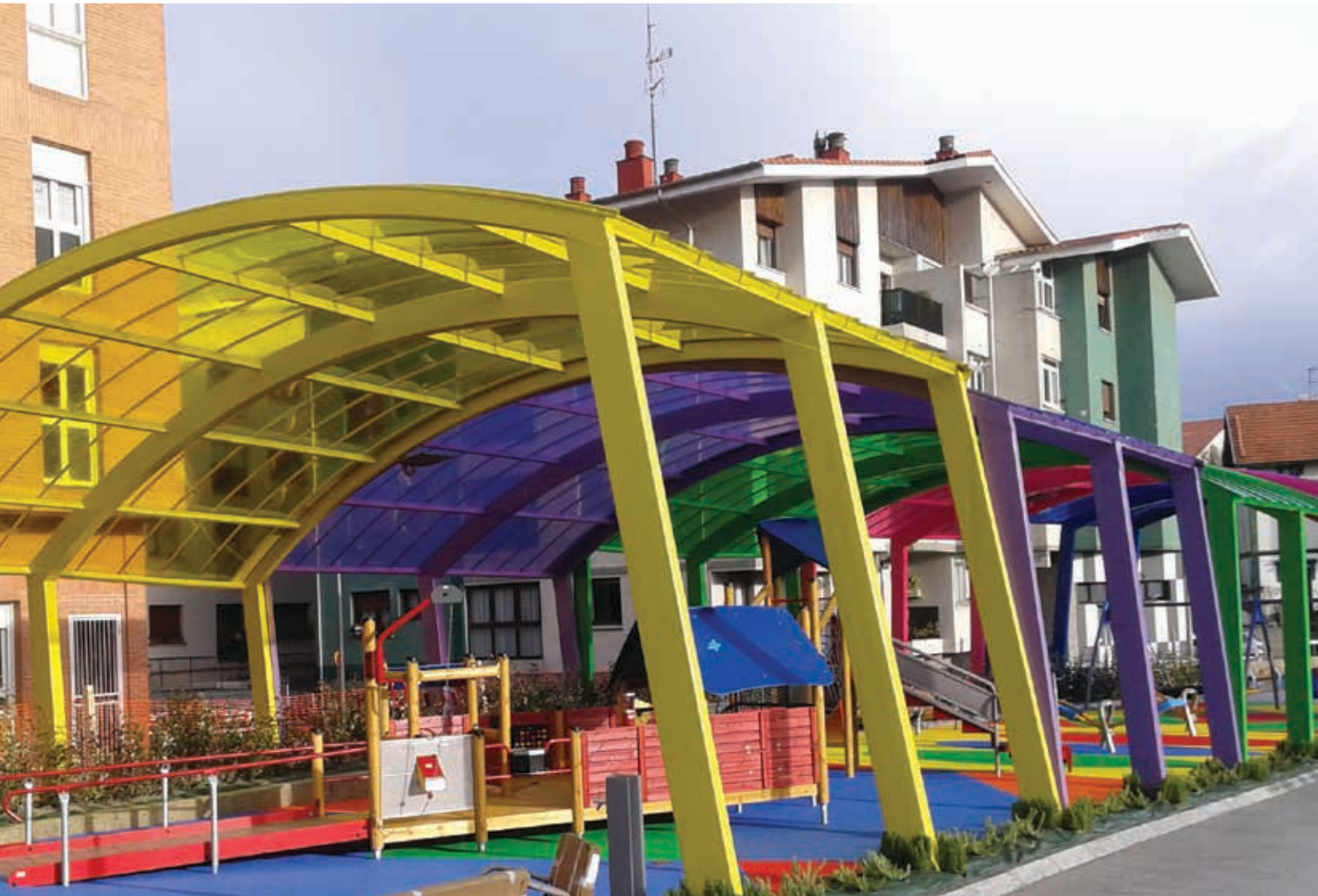
Playground, Spain | Danpal® Compact | Architect: Kepa Sacristan

Aluminium or polycarbonate connectors offer architects a high degree of freedom in terms of exterior building design. Up to 12.0m long panels are supplied and are available as straight panels or cold bent on site . Danpal® Compact is available in all colour ranges – easily adapting to all creative transparency ideas.