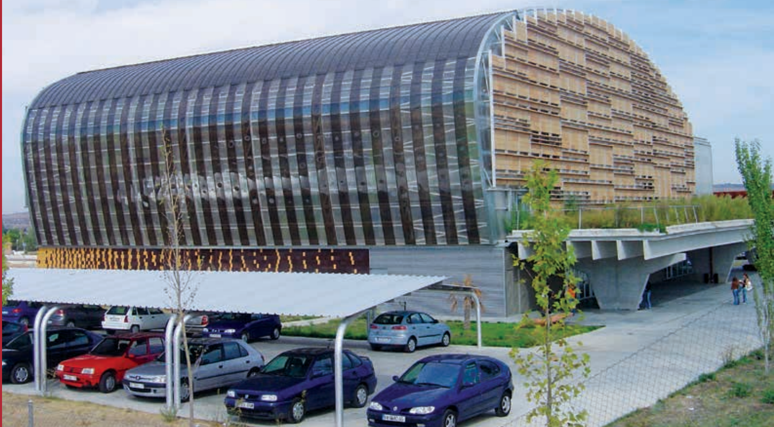
Office Building, Spain | Danpal® Compact | Architect: Pich Aguilera