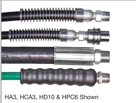
HA3, HCA3, HD10 & HPC6 Shown