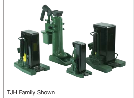
TJH Family Shown