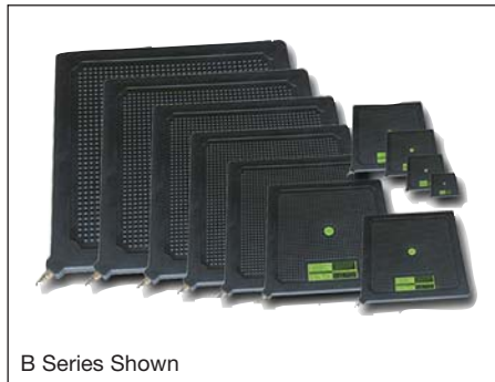
B Series Shown