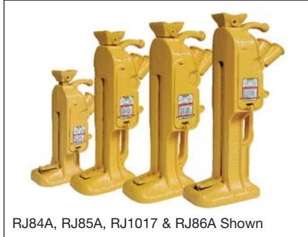
RJ84A, RJ85A, RJ1017 & RJ86A Shown