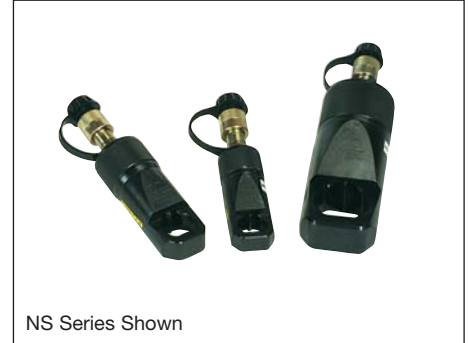
NS Series Shown