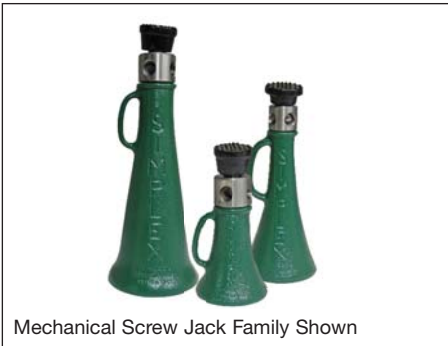
Mechanical Screw Jack Family Shown