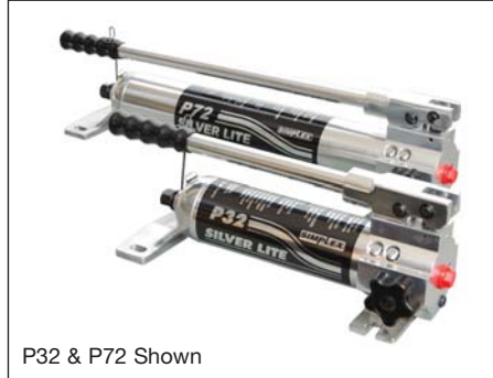
P32 & P72 Shown