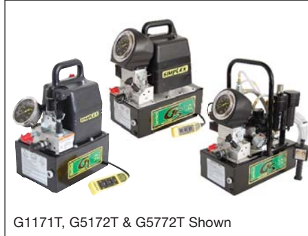
G1171T, G5172T & G5772T Shown