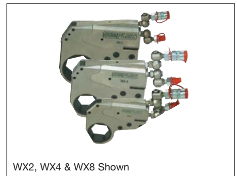
WX2, WX4 & WX8 Shown