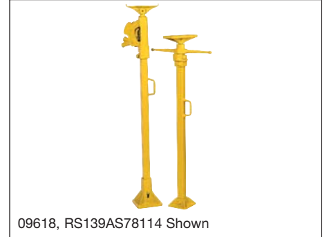
09618, RS139AS78114 Shown