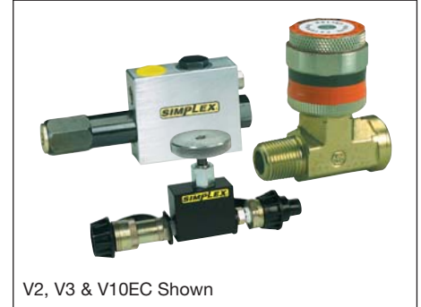
V2, V3 & V10EC Shown