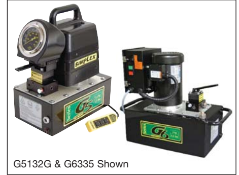
G5132G & G6335 Shown

S/A = single-acting; D/A = double-acting.