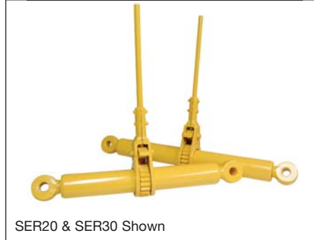
SER20 & SER30 Shown