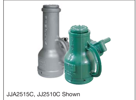
JJA2515C, JJ2510C Shown