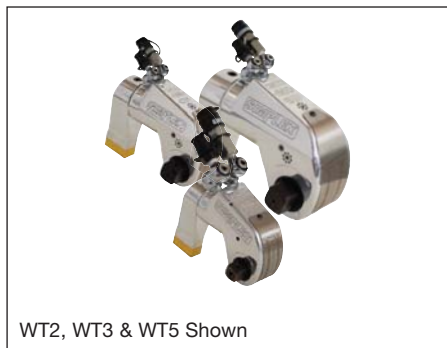
WT2, WT3 & WT5 Shown