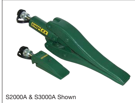
S2000A & S3000A Shown