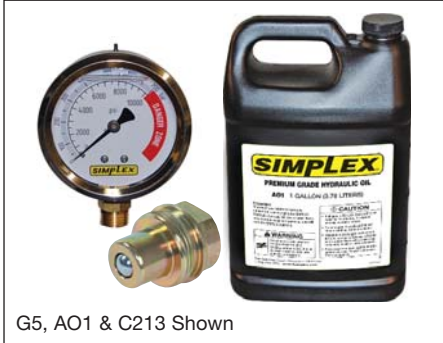
G5, AO1 & C213 Shown