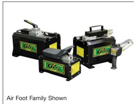
Air Foot Family Shown