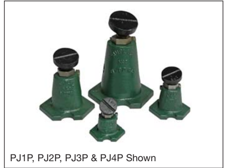
PJ1P, PJ2P, PJ3P & PJ4P Shown