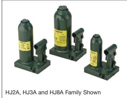
HJ2A, HJ3A and HJ8A Family Shown