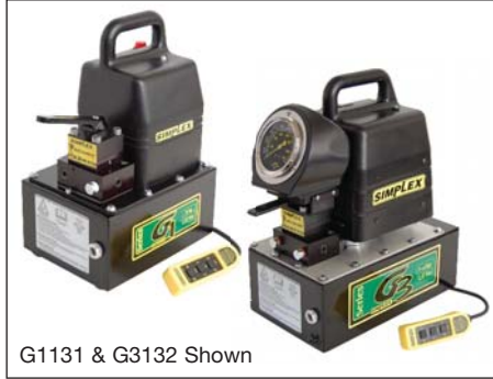
G1131 & G3132 Shown