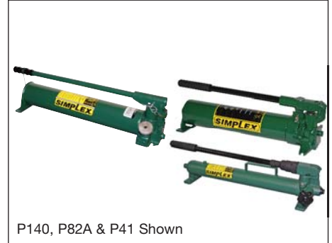
P140, P82A & P41 Shown