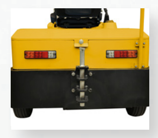
Easy Service Access via Back Cover