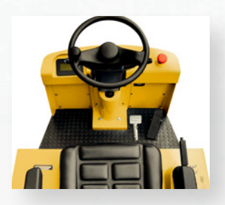
Ergonomic Operator Compartment