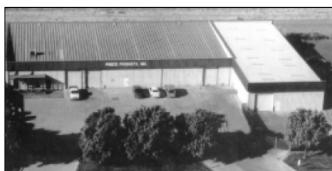
PROCO Products, Inc. Corporate Headquarters, Stockton, California.

TEFLON® is a registered Trademark of E.I. Du Pont de Nemours and company and is used under license by Proco Products, Inc