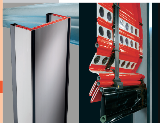
> Thermal break frame