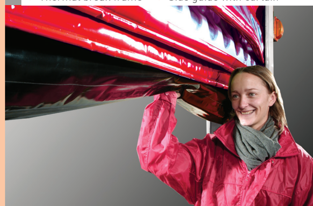
> Safety intelligent curtain