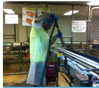
Packaging - Low Moisture