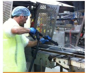
Lance Work Post Production