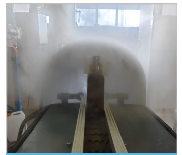
Packaging Steam Tunnel