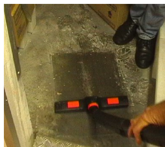
Cool room floor