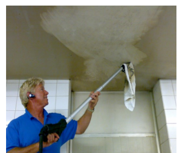
Heat Stains on Ceilings