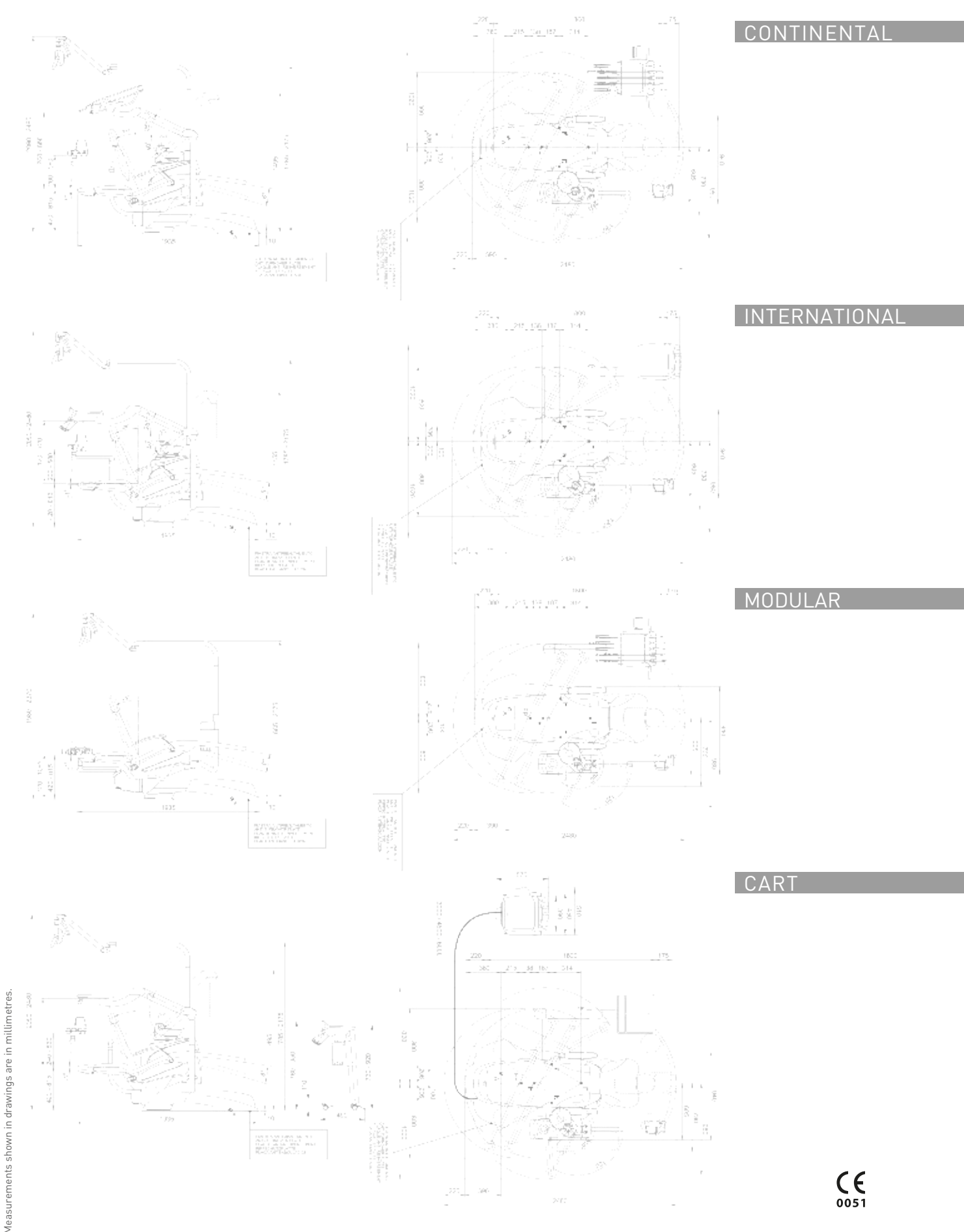
Measurements shown in drawings are in millimetres.