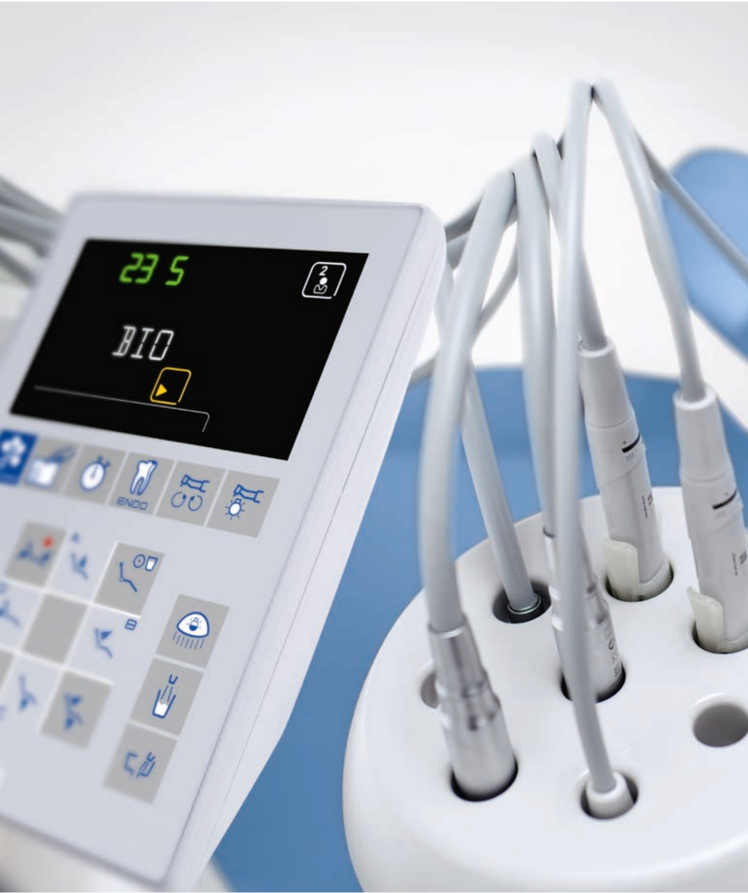
The instruments are inserted in the tray above the cuspidor bowl throughout the BIOSTER cycle.

Free to configure the dental unit with a broad selection of active devices as desired, dentists can also count on a design concept with an array of features that safeguard patient and surgery staff alike.