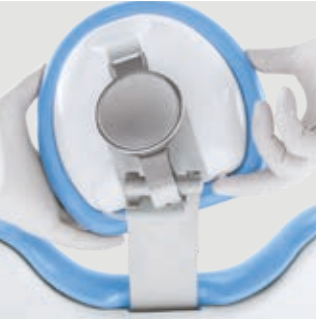
Attaxis headrest The headrest that follows the patient's anatomy. Ultra-simple fingertip release of the pneumatic lock allows orbital movement to achieve perfect positioning, vertical adjustment included.