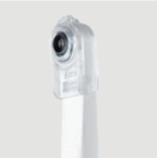
Macro Cap An extremely useful accessory, Macro Cap can magnify up to 100x in ultra-high resolution. Three additional, high purity glass lenses optimise lighting of details located close to the optical unit.