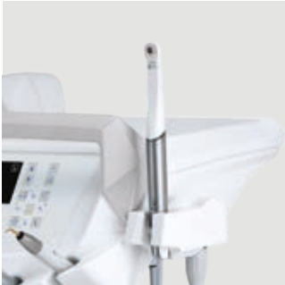
Sixth instrument The international dentist's module can be completed with an optional sixth instrument: camera or T-LED light.