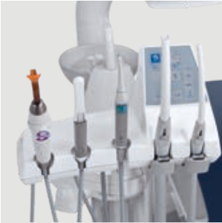
Assistant's module The module mounted on the double-articulated arm is height-adjustable and comes with three holders as standard. An optional 5-holder version is also available: this can be used to hold other instruments such as a video camera or T-LED light. The keypad incorporates controls that move the patient chair, switch on the operating light and operate the water-to-cup and cuspidor bowl rinse functions.