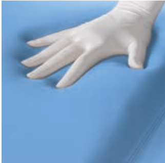
Memory Foam Exceptional comfort and proper anatomical support thanks to special upholstery options.

The patient chair is equipped with Soft-Motion technology, which ensures both silent running and fluid, vibration-free movement.