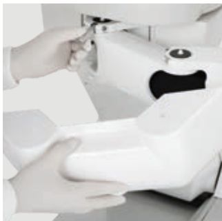
Support release Once the cover has been removed just free the mechanism that allows re-positioning from right to left and vice versa.

Ideal for multi-operator surgeries where both right-handed and left-handed dentists practice, the S210LR can be re-positioned in just a few quick, simple steps that require neither tools nor technicians. The switch can even be made by the assistant on his/her own. The dentist's module rotates on the fixed pin under the seat; the unit body - arm and assistant's module included - can be moved from one side to the other after releasing the support.