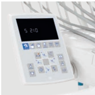
Re-positionable control panel Continental model users can move the control panel to the opposite side of the dentist's module, thus optimising ergonomics and making the dental unit 100% ambidextrous. Just rotate the on-panel connector 180° and reconnect it to the tablet. The task takes less than a minute.