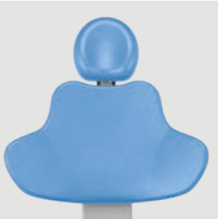
Nordic backrest Ensures lasting comfort during protracted treatment sessions and shaped to aid dentists who work in 'indirect vision' mode.