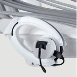
Zen-X X-ray sensor Extractable sensor with USB lead located on the dentist's module, can capture high-resolution images with minimal radiation dosage. Able to be sanitised, the sensor comes in two different sizes and is IP67 certified against water and dust infiltration.