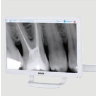
22" LED Monitor 93/42/EEC certified, the monitor is also available in the multitouch version; the screen can be positioned as desired.

Coupled with a latest-generation HD video camera, the Full HD 16: 9 tilt-adjustable 1920 x 1080 pixel flat screen medical monitor can be lead-connected to a PC. The LED light sources ensure high levels of contrast and brightness, while the IPS panel, which significantly broadens the screen viewing range, allows images to be comfortably viewed from any angle.