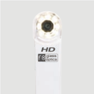
C-U2 HD camera The video camera aids dentist-patient communication and, thanks to the slender handpiece design, it can reach distal zones with ease. Excellent depth of field eliminates any need for manual focusing. Speeds up diagnostics and generates material for documenting the treatment and completing clinical reports.