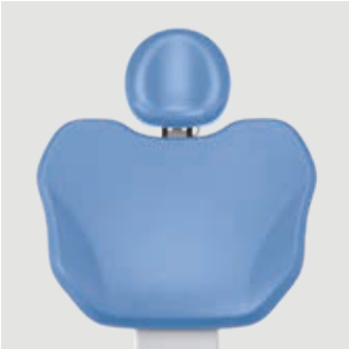
Standard backrest Shaped so that dental staff can move closer to the patient during treatment. Suitable for adults, children and any treatment type.