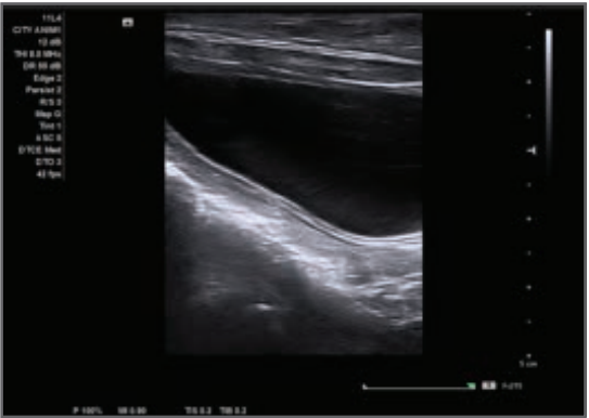
Dynamic TCE (tissue contrast enhancement) with Advanced Sieclear imaging gives you better border detection with improved tissue differentiation as seen in this bladder image.

Designed to elevate your daily imaging routine, the ACUSON NX3 Elite features the latest ultrasound innovations from Siemens Healthineers. These tools adapt to your dynamic needs by offering enhanced clarity across a wide range of applications. With imaging solutions built for performance, you can approach each exam with a greater level of diagnostic confidence.