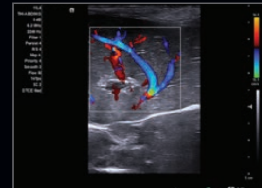
Outstanding color Doppler sensitivity with one touch flow state optimization leading to increased efficiency.