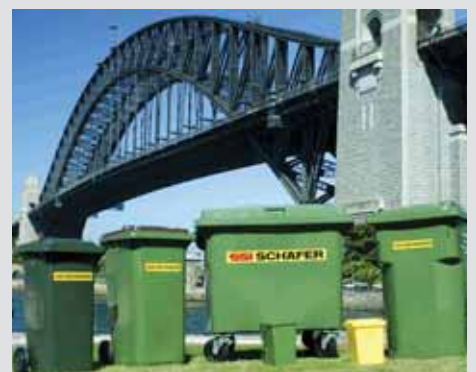
Waste Management Systems