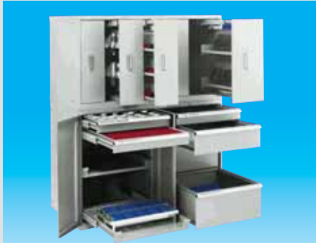
Cabinets & Workshop Equipment