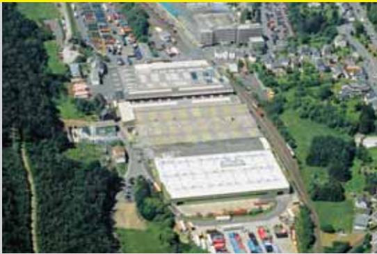
Fritz Schaefer GmbH, Germany