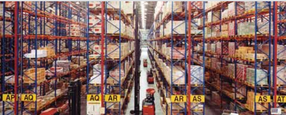
Interlock Pallet Racking Systems