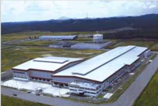
Simpang Renggam Factory, Malaysia