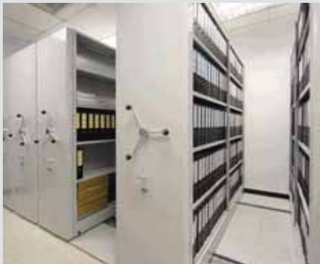
Regal Office Shelving System