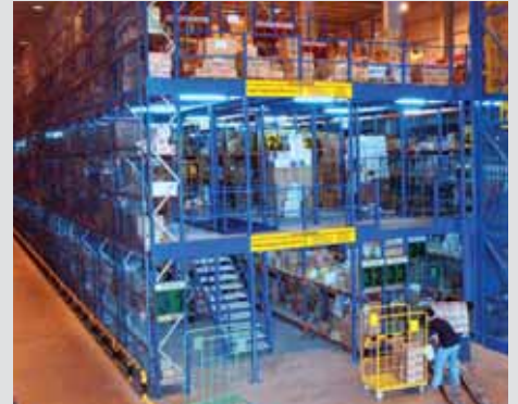
Multi-tier Storage Mezzanines