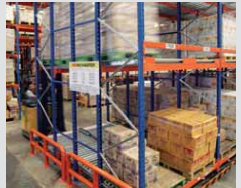
Live Storage Systems