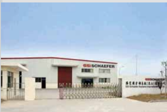
Kunshan Factory, Shanghai China