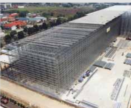
High Bay Racking & Rack Clad Structures