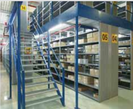
Modular Shelving Systems