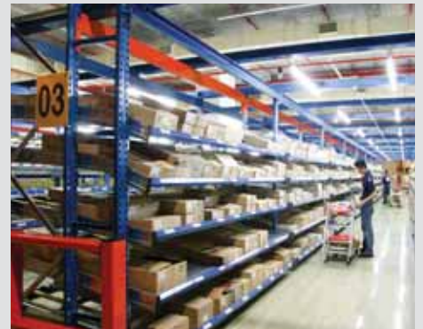
Carton Live Storage & Pick Modules