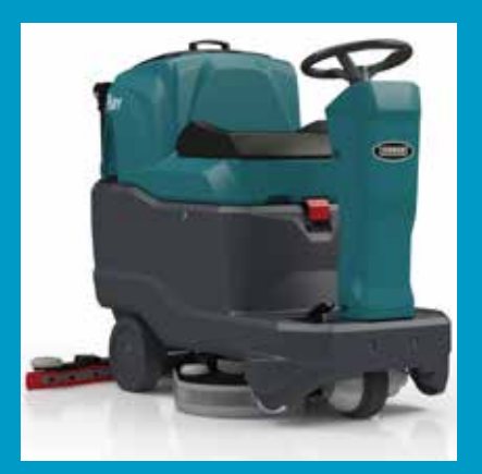
Extended Run Times Increase run-times by nearly 20% with ECO mode that decreases battery consumption during operation.

Simple Operation Ease of start-up and quick training with one-button cleaning operation that lowers the scrub head and squeegee at the same time.