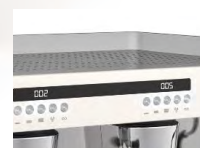
Display (PID controlled)