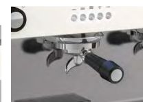
TA (Take Away)/High Group

Crem EX3 is an attractive and extremely versatile professional espresso machine. Featuring a smart design concept it can be easily customized, and manufactured through the combination of numerous different options , both external (number of groups, colours and finishings, lighting, etc.) and technical. Thus, the EX3 is aimed to suit any kind of business with an espresso demand, whatever it is an independent or a national coffee shop chain.