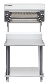
CS9 / C900-S