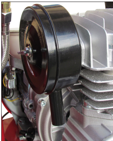
Metal Air Inlet Filter