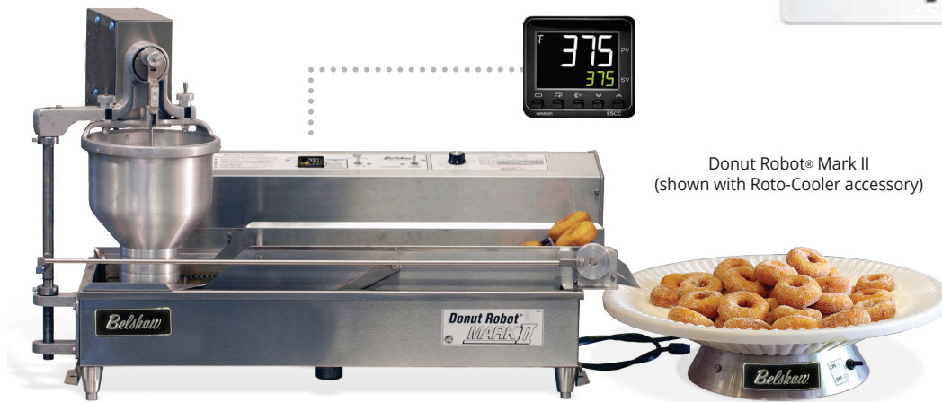
Donut Robot® Mark II (shown with Roto-Cooler accessory)

Belshaw's Donut Robot® fryers are highly versatile and can produce Cake Donuts, Mini Donuts, Ball Donuts (Donut Holes) and Raised Donuts. Training and labor requirements are minimal to produce a high quality, consistent product.