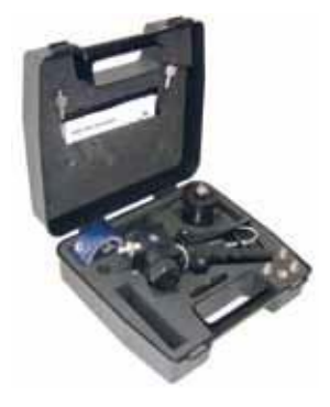
Pneumatic and hydraulic test kit