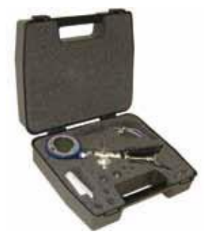
Pneumatic test kit