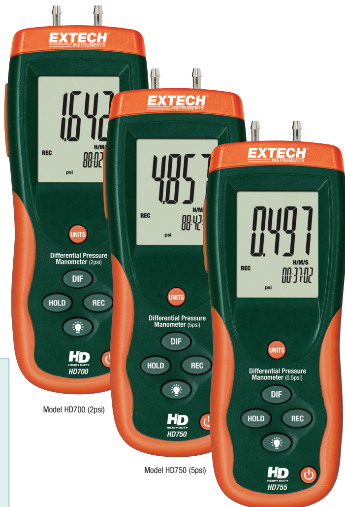
Model HD700 (2psi)