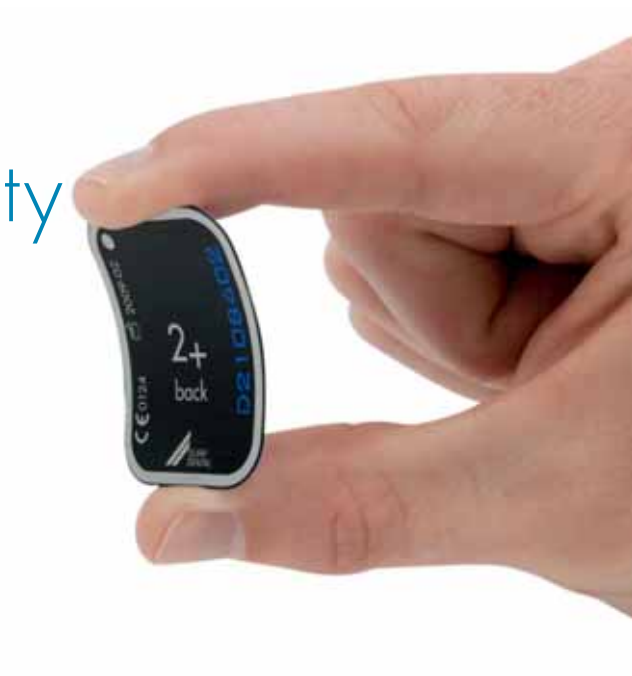
Digital X-ray with image plates the flexible solution