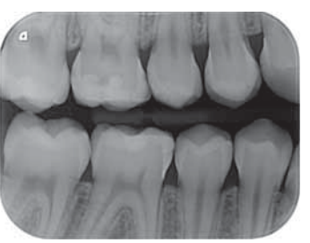
High-resolution posterior bite wing images for perfect diagnostics

The effective image resolution of X-ray systems in comparison: The VistaScan systems from Dürr Dental achieve the highest resolution compared with the competition. Latest studies show that image plate technology is the only sure way to uncompromised digitisation