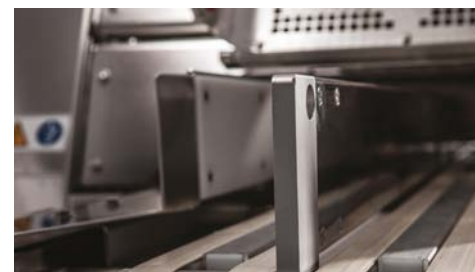
Double row infeed option.