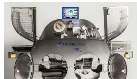
Very accessible inner parts.