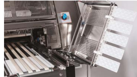
Machine exit conveyor.