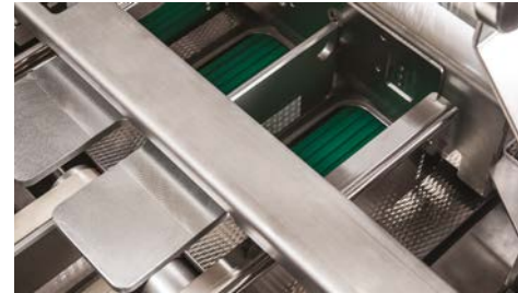
Tool workstation area.