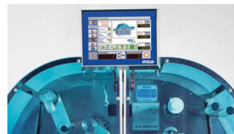
Touchscreen monitor for machine interface.