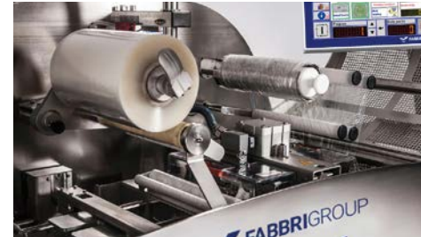
Film unwind and tool workstation area.