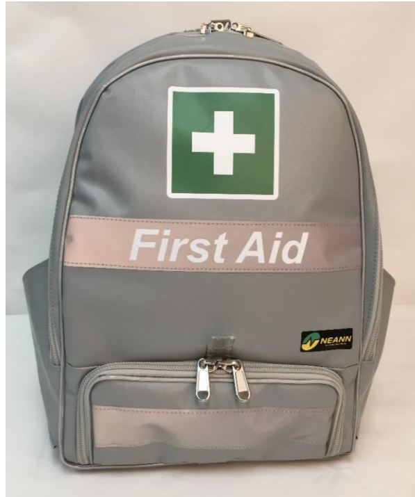
Defibrillator compartment (below)