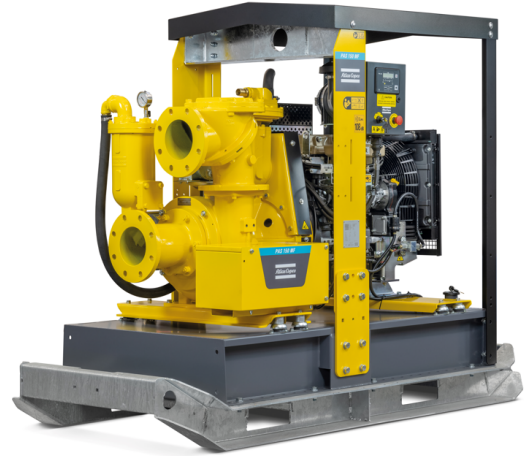
Indicative picture of the product