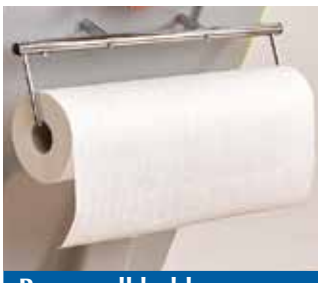
Paper roll holder