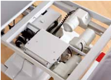
The four motors are positioned directly under the removable seat for easy servicing.