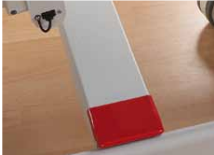
The large red footswitch allows quick adjustment of the shock position from both sides - the nursing staff's hands remain free for the patient.