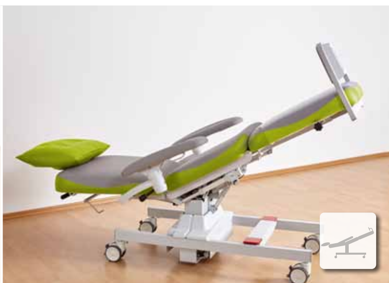
Fast shock position in case of emergency

The new UniversalLine2 is ideal for outpatient care of your patients.