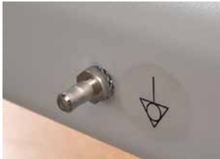
Equipotential bonding according to EN 60601 increases safety for your patients.