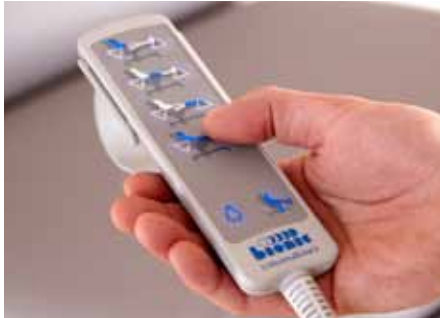
The illuminated hand control has a clear design and allows easy adjustment of the individual segments.