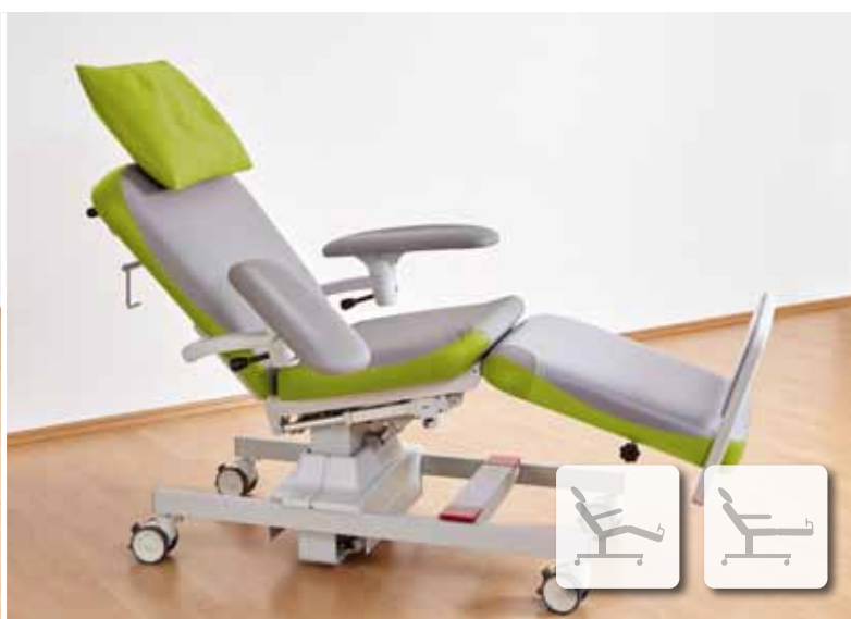
Quick adjustment of armrests