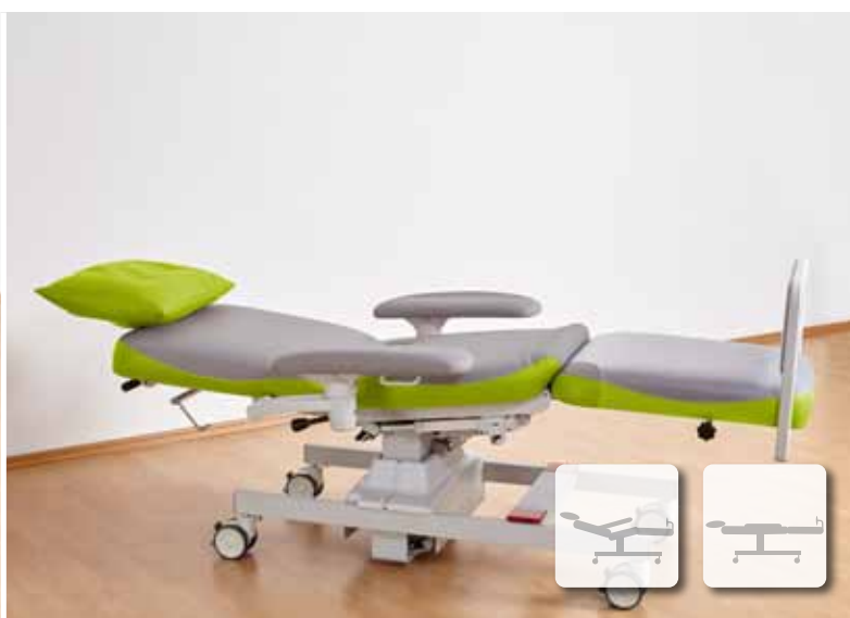
Optimal, individual relaxation through individually adjustable segments