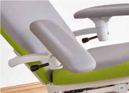
The armrest is swivelled to the side intuitively and simply with the aid of the lever, and can be lowered forwards for optimum positioning.

The colour of the therapy chair can be adapted to the furnishing of your ward because of the many different colours and the modern bi-colour design. In addition to the colour samples on the right, other colours are also available. Please contact us for the extensive colour chart.