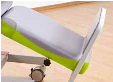
The manually adjustable footrest gives both small and large patients a safe feeling during treatment.