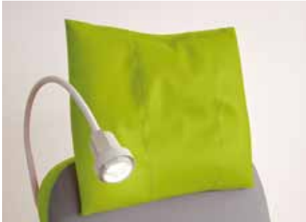
The comfortable pillow can be individually adjusted in height with a star screw.