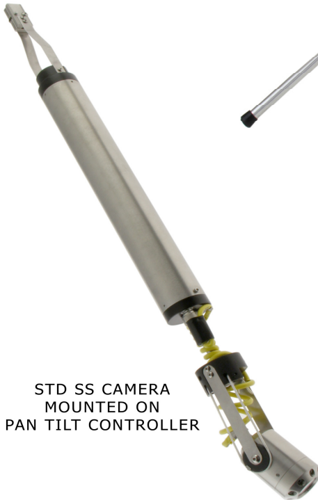
STD SS CAMERA MOUNTED ON PAN TILT CONTROLLER