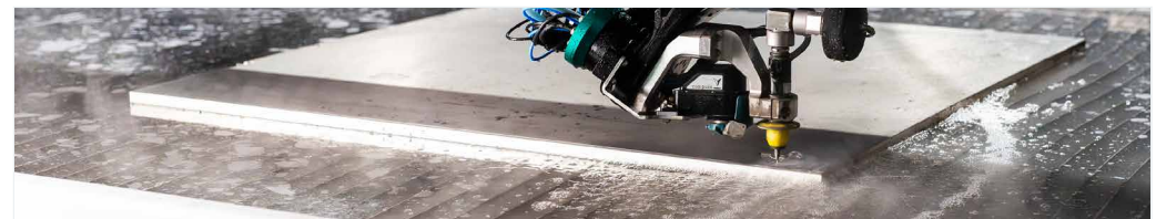
Heavy Gauge Steel Fabrication