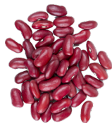
Beans & Legumes