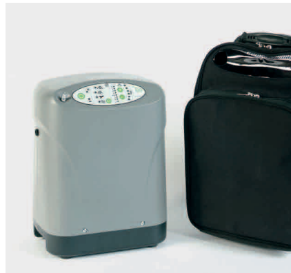
iGo and wheeled carry case

Low oxygen, No flow, No breath w/failsafe, Low battery, No power, Unit malfunction and High temperature