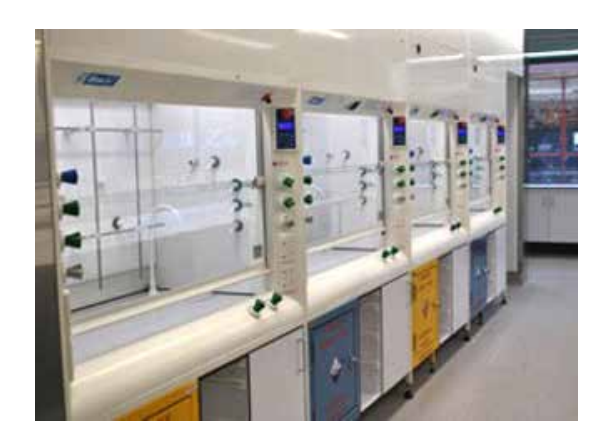
EcoAir® laboratory fume cupboard.

If the sash is opened above normal working height – 730mm is maximum – airflow at the sash will be reduced to an unsafe level. Labrocare® fume cupboards provide a lock at normal working height. It serves as a barrier that must be disabled by the operator to raise the sash above 500mm; it automatically relocks when the sash is lowered.