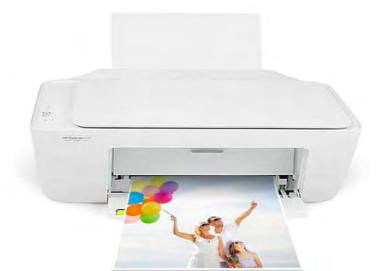
External Laser Printer (Optional).