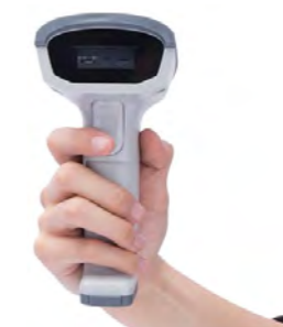
Barcode Scanner (Optional).