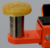
Screw Pad / 4WD Adapter