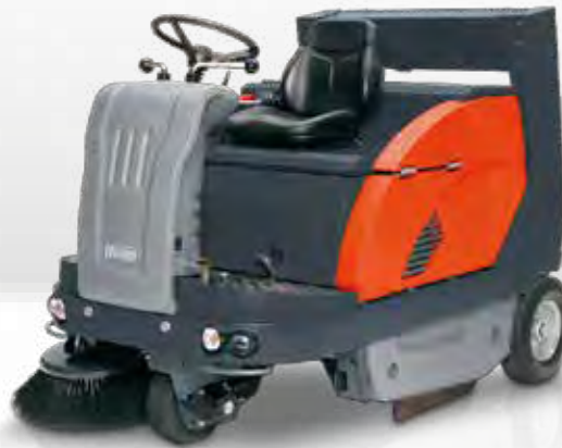
Sweepmaster P1200 RH