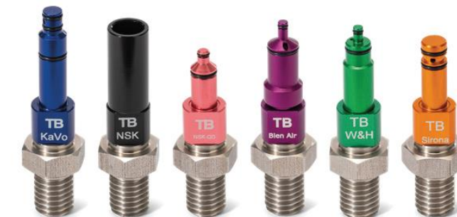
EasyAdapter adapters for turbines