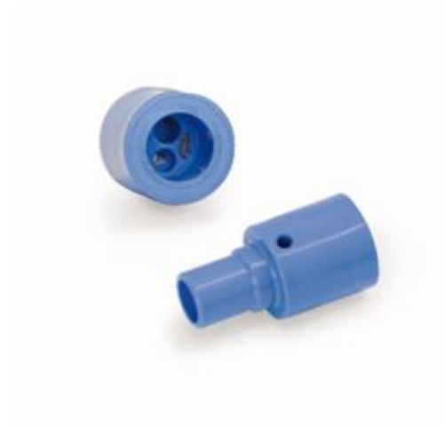
Adapter for handpieces