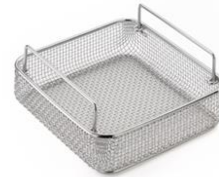
Net basket DIN 1/2