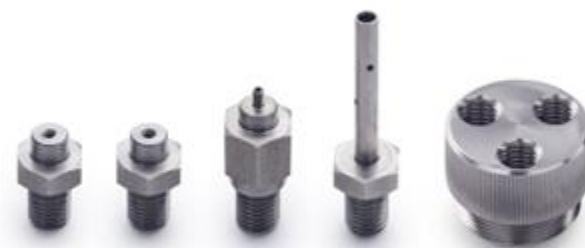
Adapters, injector and connector