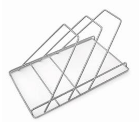
2-position insert for trays, instrument cassettes (5 cm slots)