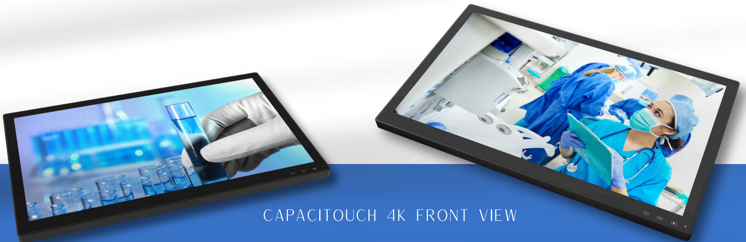
CAPACITOUCH 4K FRONT VIEW