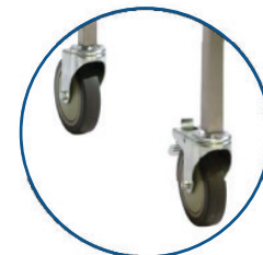
125mm castors with 2 x locking castors