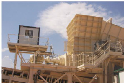
800 SERIES PRIMARY & 505 SERIES SECONDARY