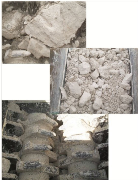
875 SERIES SIZER-HARD ROCK