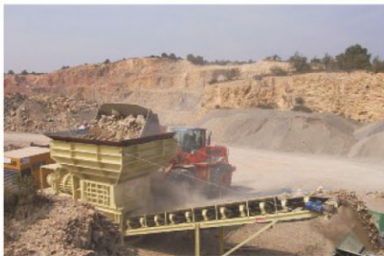
1000 SERIES SIZER-2000 TPH