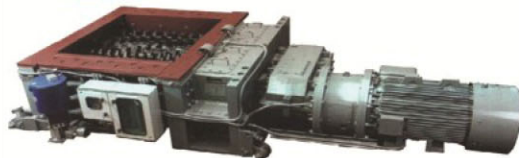
S660 HEAVY DUTY TWIN SHAFT MINERAL SIZER