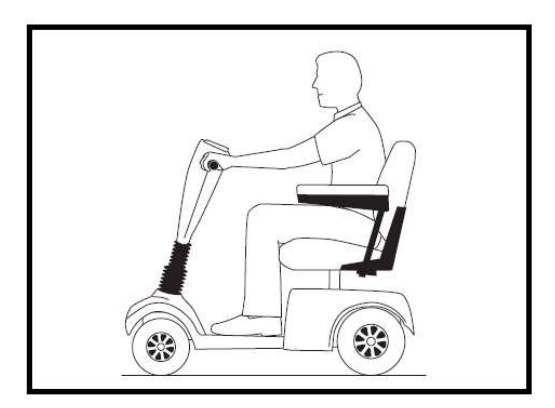
Figure B. Normal Driving Position

WARNING! Never carry an oxygen tank weighing more than 15 lbs (6.8 kg). Never put more than 5 Kg (11 lbs) in the front basket or more than 8 Kg (17.6lbs) in the rear basket.