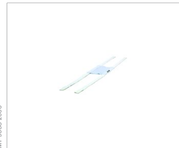
Headgear, soft rubber