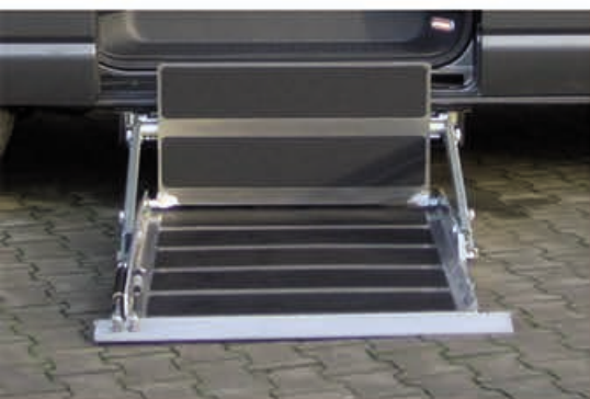
Large lifting platform with barriers