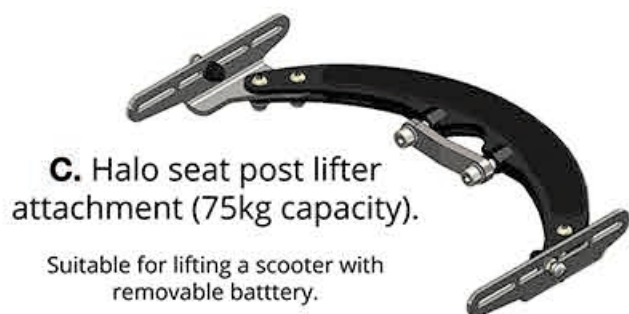
C. Halo seat post lifter attachment (75kg capacity).

Suitable for lifting a scooter with removable battery.