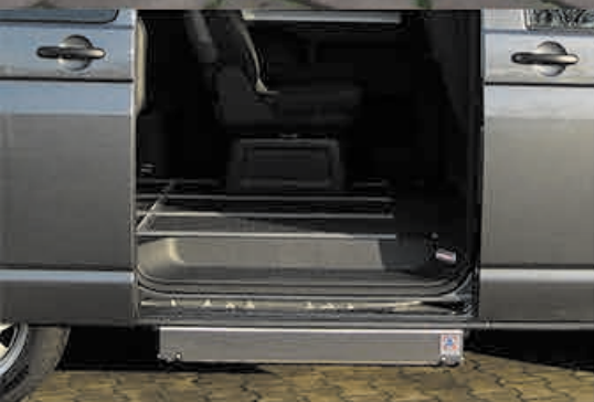
Ultra slim view when not in use