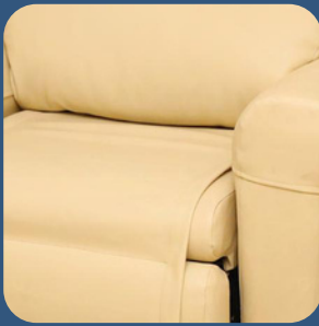
1. Extra covers