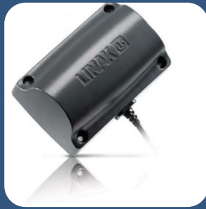
2. Inbuilt massage function