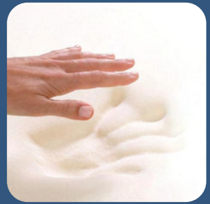
4. Pressure prevention seating/overlay