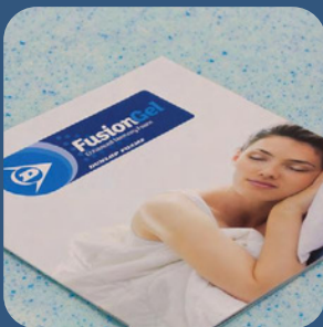
5. Gel fusion seating/overlay