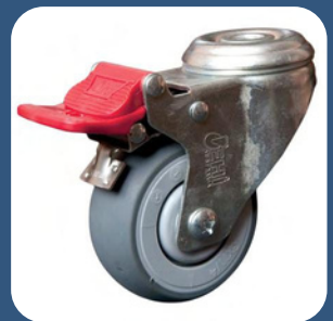
8. Hospital wheels