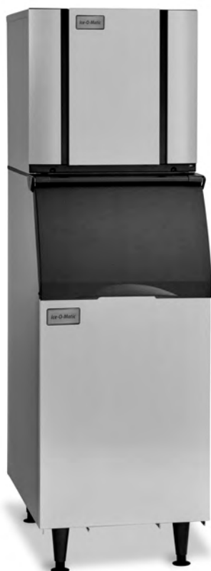
CIM1125 ON B42