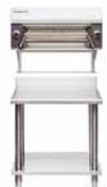
CS9 / C900-S