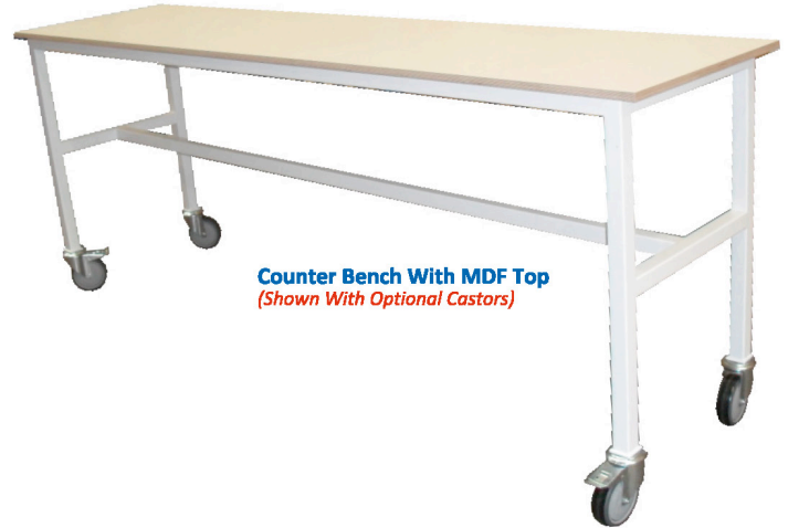
Counter Bench With MDF Top (Shown With Optional Castors)