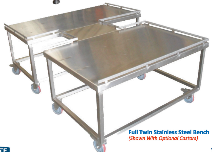
Full Twin Stainless Steel Bench (Shown With Optional Castors)