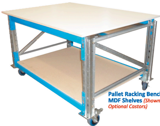
Pallet Racking Bench With MDF Shelves (Shown With Optional Castors)