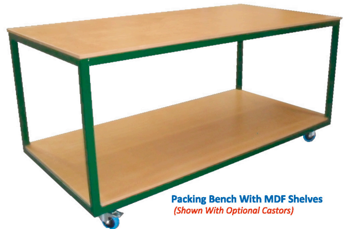
Packing Bench With MDF Shelves (Shown With Optional Castors)