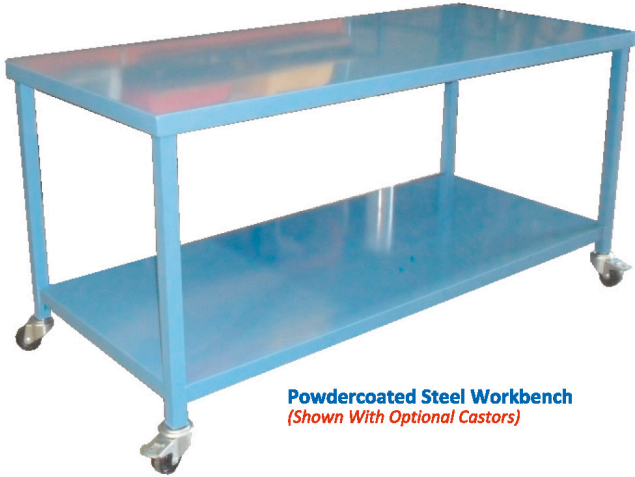
Powdercoated Steel Workbench (Shown With Optional Castors)

Δ Quality Workbenches Made to Suit Any Application Δ Tente Can Design Your Workbench if Required Δ Made from Powdercoated Steel, Stainless Steel, Galvanised, MDF Tops, Laminate Tops Etc to Suit Packing Areas, Food Areas, Workshops Δ Optional Castors Available