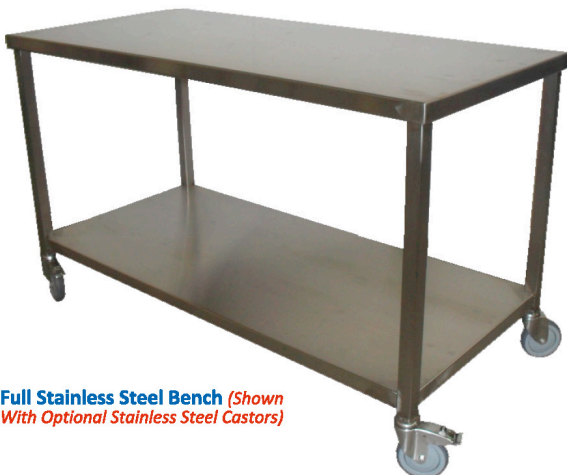
Full Stainless Steel Bench (Shown With Optional Stainless Steel Castors)