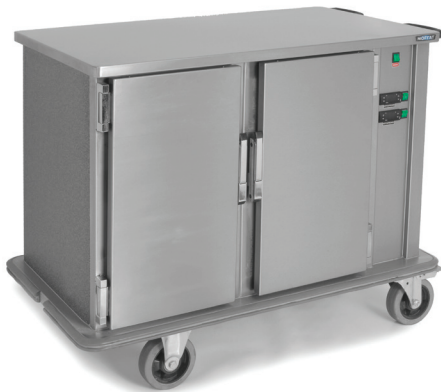
BF2 Bulk Food Trolley

The BF2B, BF2BR, BF3B and BF3BR also feature Bains Marie with covers to the top of the unit along with the combinations of ambient, heated or refrigerated compartments below.