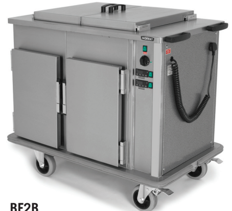
BF2B Bulk Food Trolley with Bains Marie

Conversion kit to transform compartment to accommodate plated meals (PM).