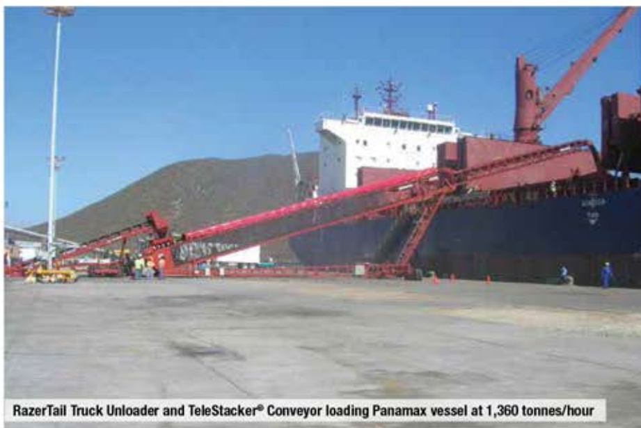
RazerTail Truck Unloader and TeleStacker® Conveyor loading Panamax vessel at 1,360 tonnes/hour