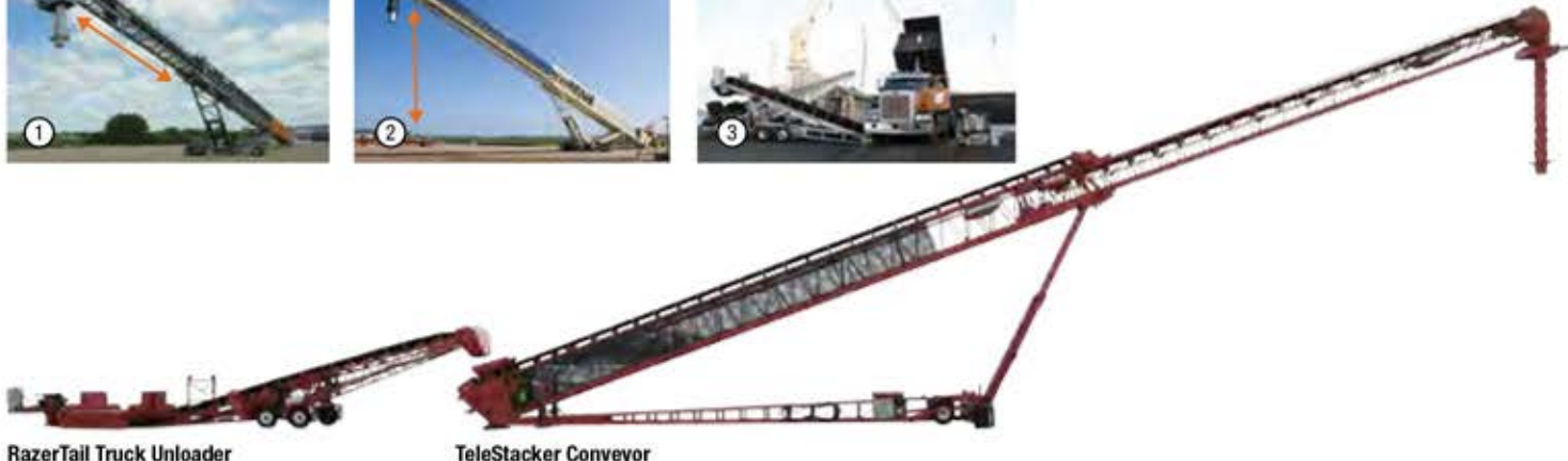
RazerTail Truck Unloader