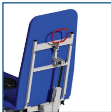
CPR Motor Back