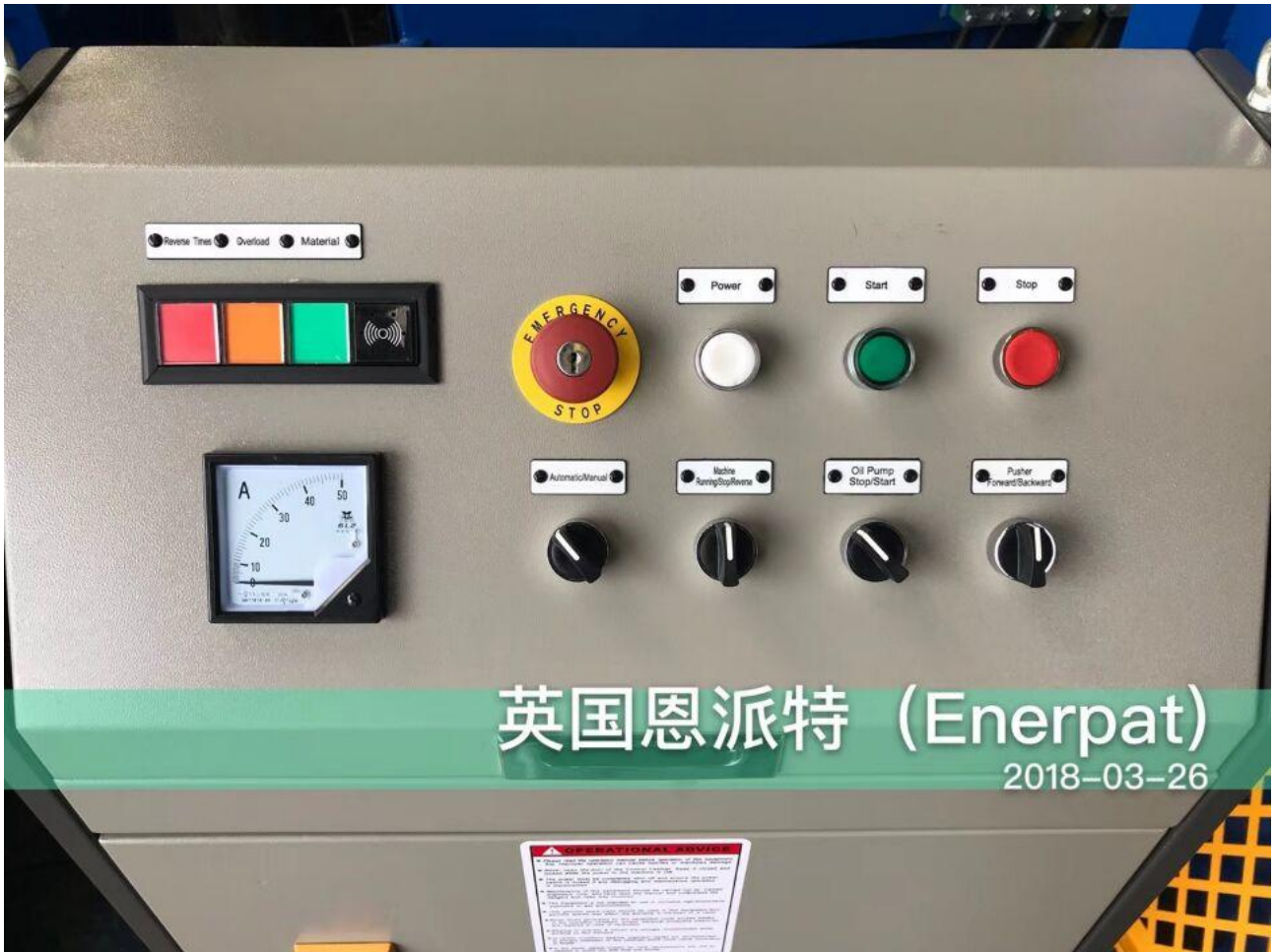
英国恩派特 (Enerpat) 2018-03-26