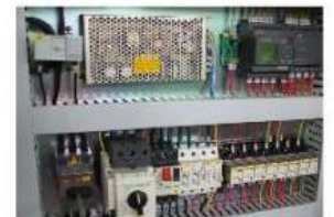
Electric Control Panel

After the material enters the equipment through the hopper, the pushing box (3) drives the material to the knife rotor (1) driven by the hydraulic Power unit. Knife rotor driven by driving system to shred materials. The shreds are discharged through the screen (2), and the size of shreds is subject to the screen mesh size. The movable knife (A) is fixed on the knife roll (B) by the bolt. When the equipment is running, the material is shredded by the interaction between the movable and fixed knife (C); Adjust the bolt (D) to change the distance between movable and fixed knives.