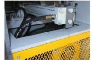
Hydraulic Power Unit