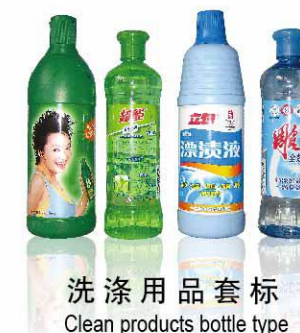
洗涤用品套标 Clean products bottle type