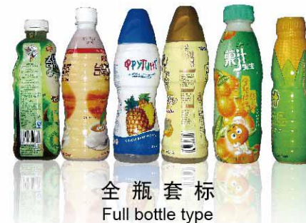
全瓶套标 Full bottle type