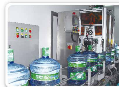
乐百氏生产现场 ROBUST PRODUCTION SITE