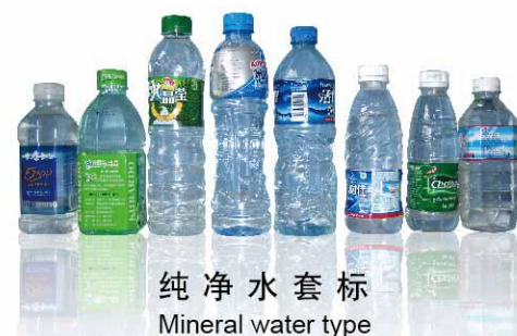
纯净水套标 Mineral water type