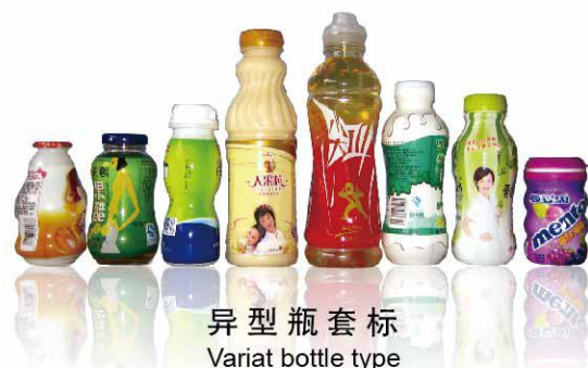
异型瓶套标 Variat bottle type

Multidirectional Sleeve label Machine Applications: