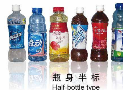
瓶身半标 Half-bottle type