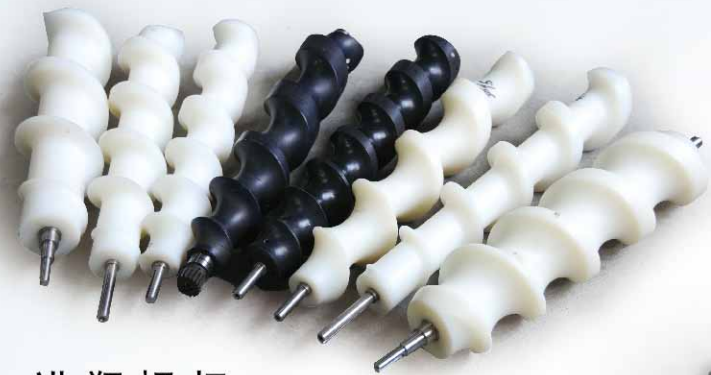
进瓶螺杆 Enter bottle screw