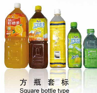
方瓶套标 Square bottle type