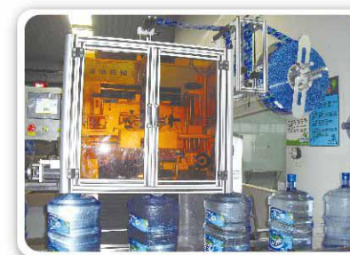
达能生产现场 DANONE PRODUCTION SITE