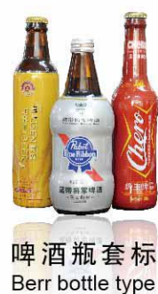
啤酒瓶套标 Berr bottle type