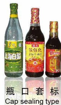
瓶口套标 Cap sealing type