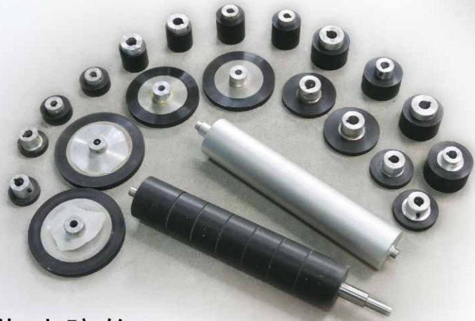
传动胶轮 Driver roller