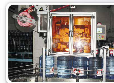
娃哈哈生产现场 WAHAHA PRODUCTION SITE