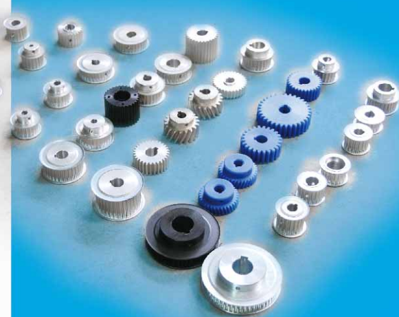
传动齿轮 Transmission gears